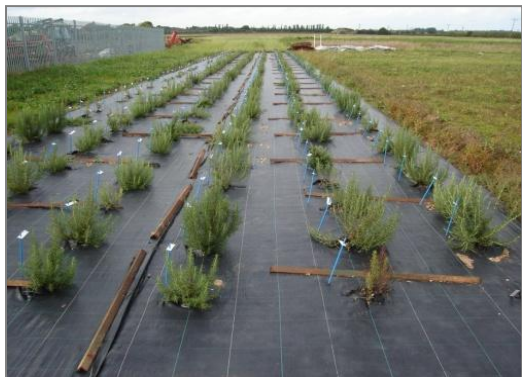
NIAB Nursery, 10 th September 2008 showing good early vigour

Many plants were eliminated because they were killed by the cold weather during the winters of 2008/09 and 2009/10 or the plants showed no productive vigour (leaf yield). Analytical results from the remaining 109 lines identified 3 strong candidates which were further evaluated.