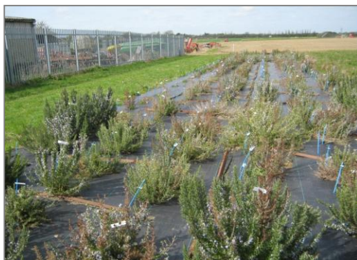
NIAB Nursery, 16 th April 2010 showing winter damage

The Polymer Processing and Performance (PPP) Research Group at Aston University focused on examination of the antioxidant performance of AOs in polyolefins. The antioxidant activity of the parent RA and CA were examined, as well as that of the synthesised AOs for their free radical scavenging efficiency and in many other tests.