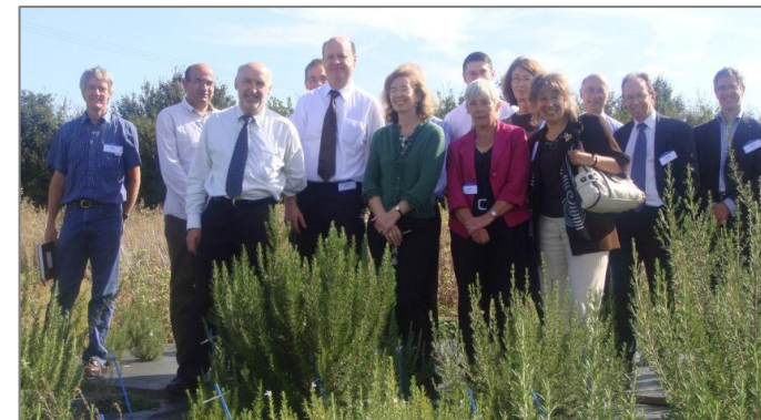
ROSEMARY project partners at NIAB research fields, Cambridge, UK

The AOs of interest were major rosemary plant constituents: carnosic acid (CA), rosmarinic acid (RA) and carnosol. NIAB supplied over 300 rosemary samples of different origins from harvests over years 2007 to 2010. The AO content in different strains of rosemary was very diverse; this could be used to target a particular component if necessary.